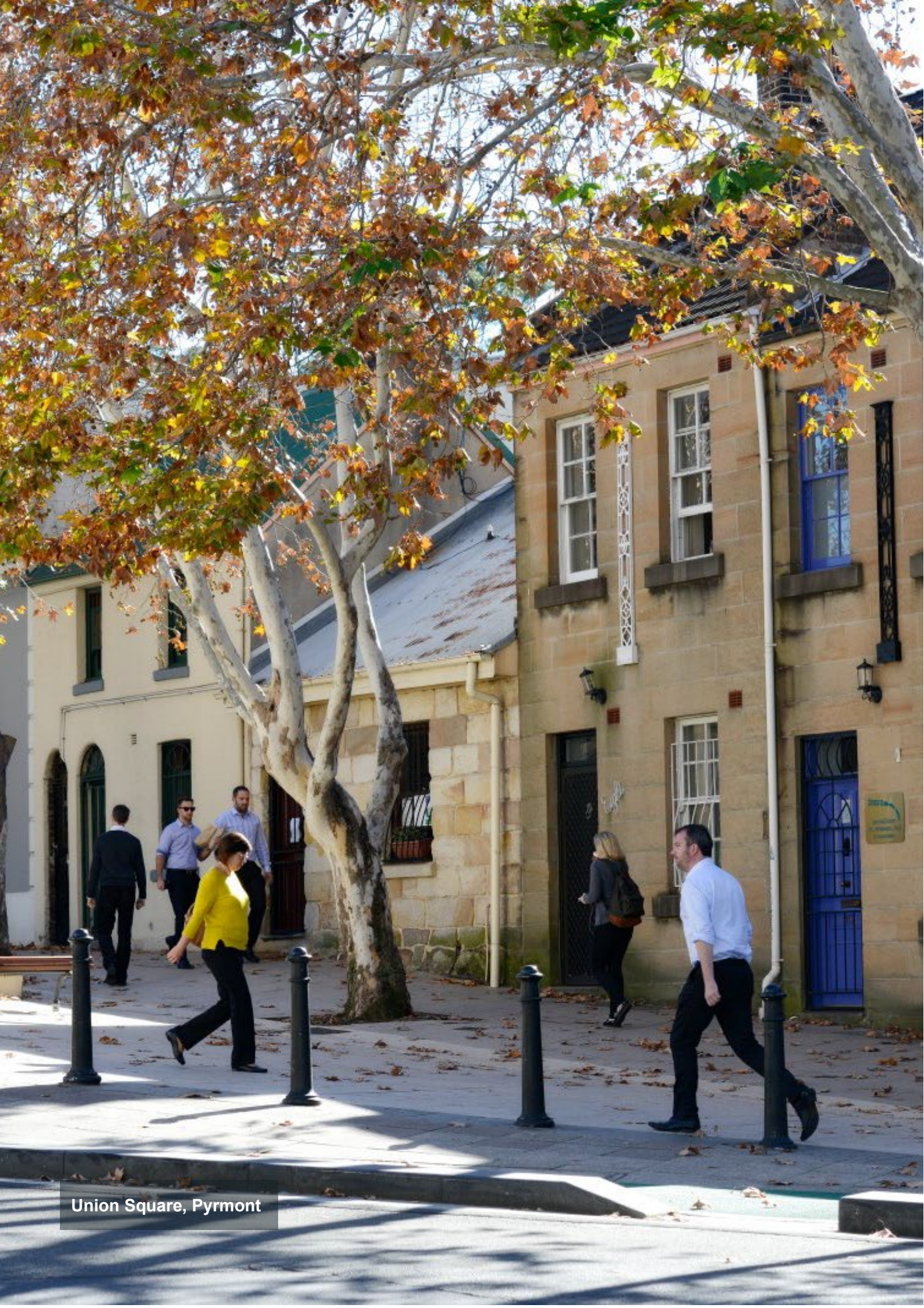
Union Square, Pyrmont