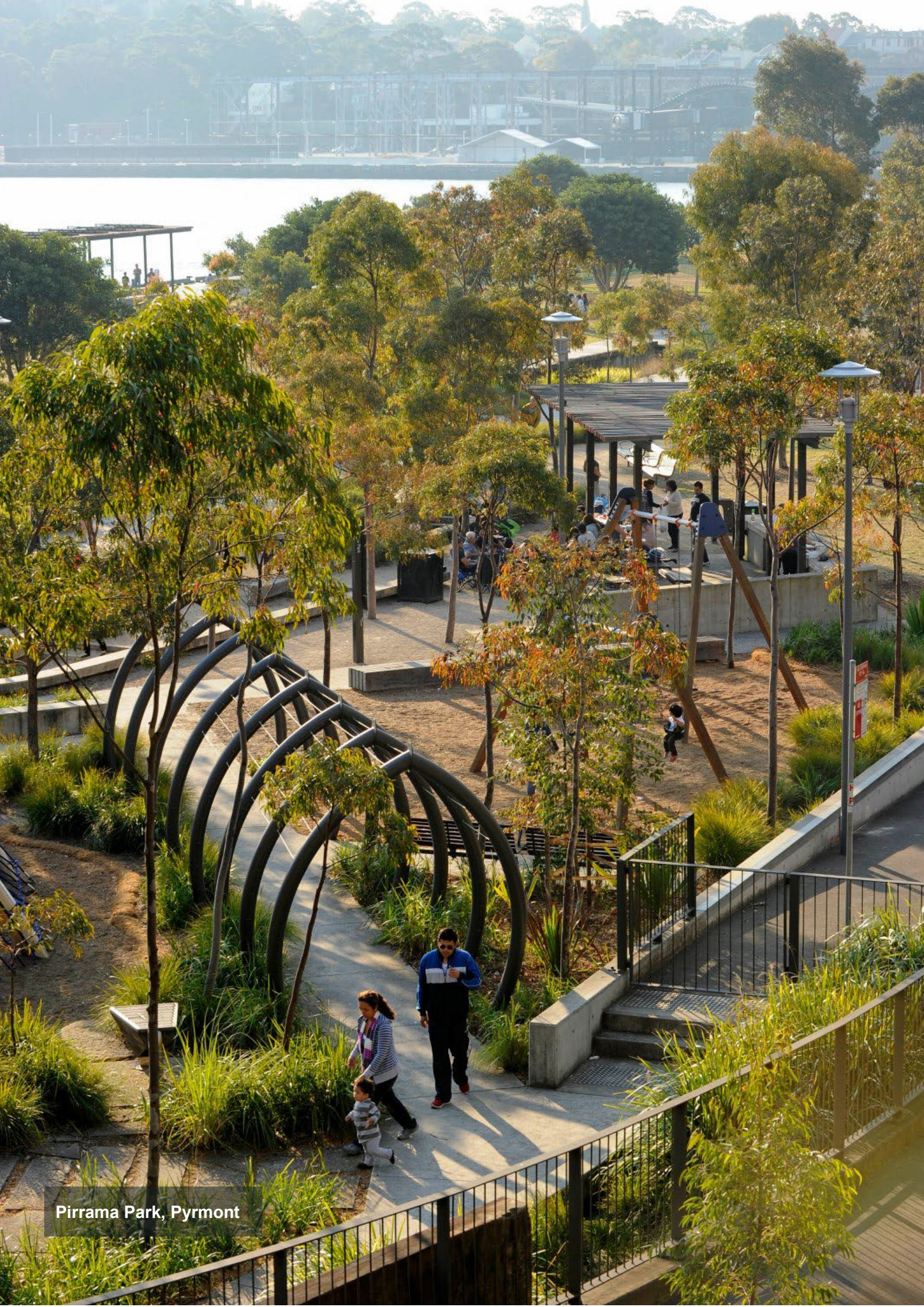
Pirrama Park, Pyrmont