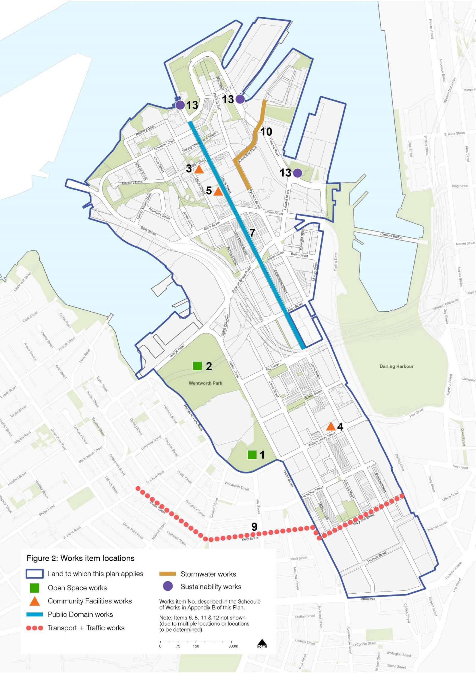
Figure 2: Works item locations