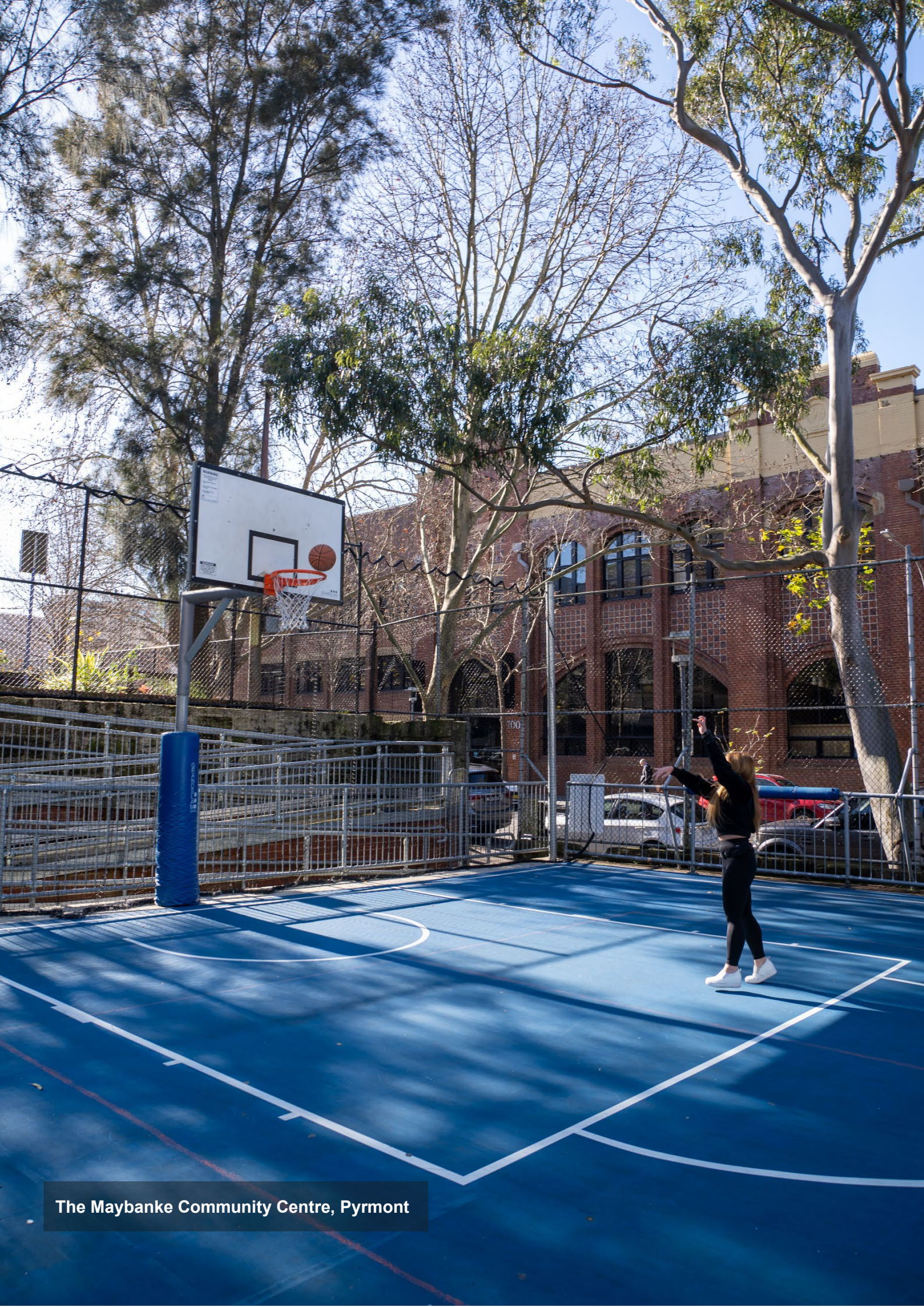
The Maybanke Community Centre, Pyrmont