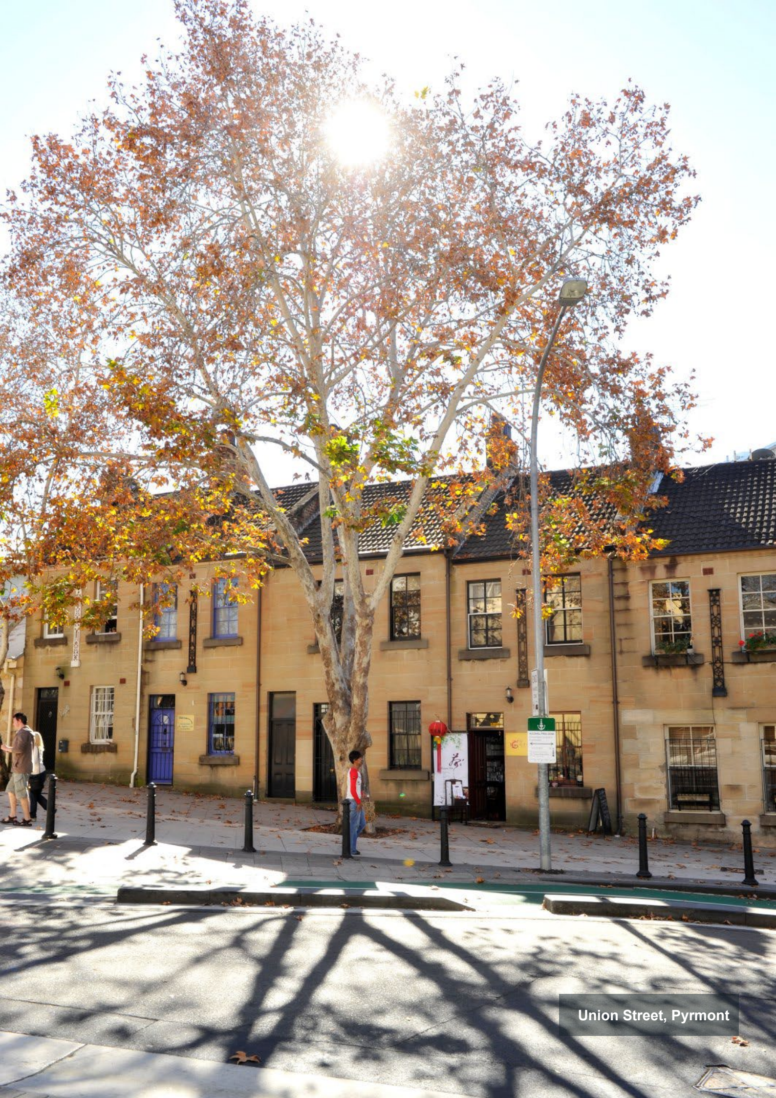
Union Street, Pyrmont