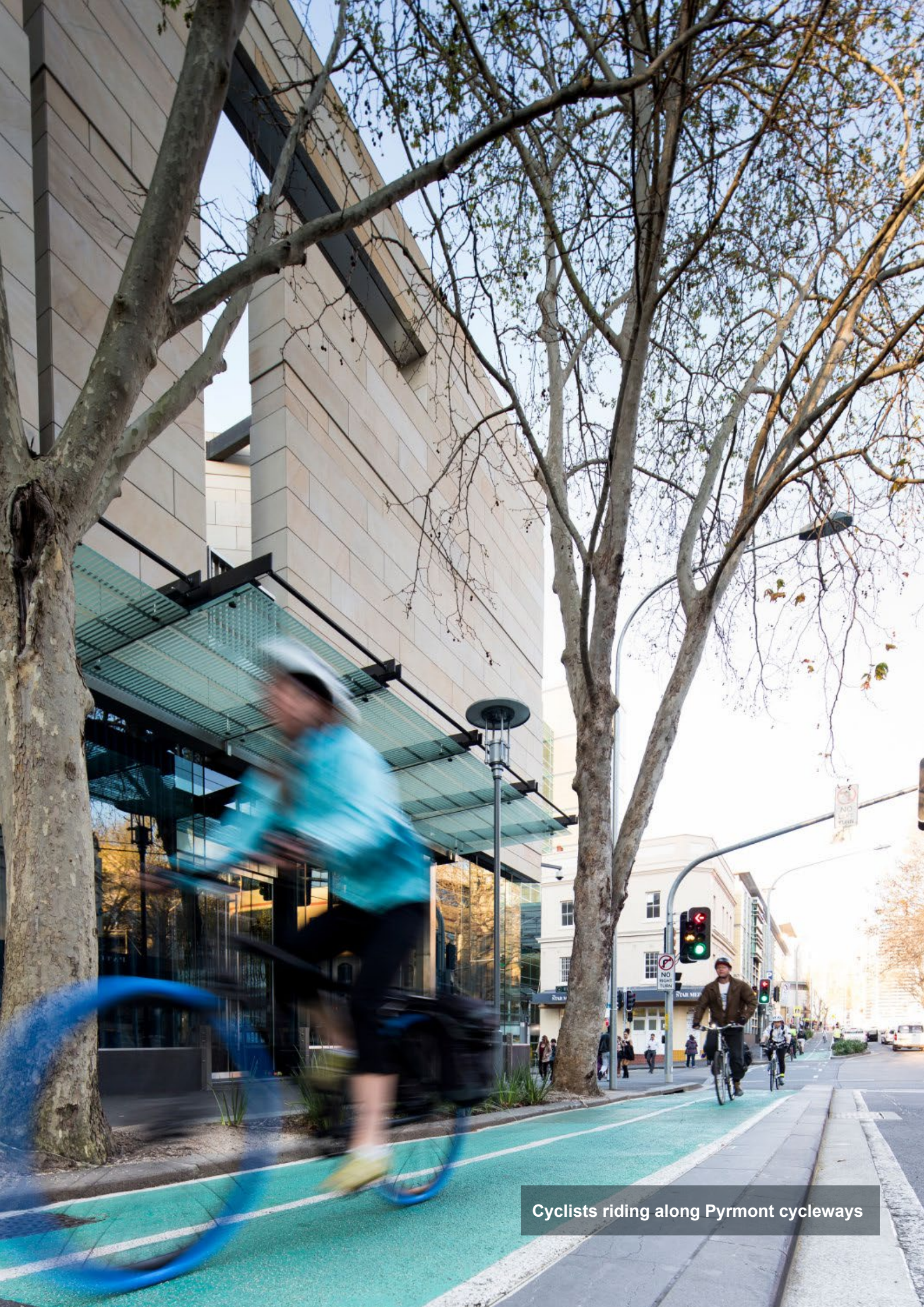
Cyclists riding along Pyrmont cycleways